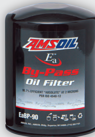
EaBP90 • EaBP100 • EaBP110 • EaBP120

AMSOIL Ea Bypass Oil Filters provide maximum filtration protection against wear and oil contamination. Working in conjunction with the engine's full-flow oil filter, AMSOIL Ea Bypass Filters operate by filtering oil on a "partial-flow" basis. They draw approximately 10 percent of the oil sump's capacity at any one time and trap the extremely small, wear-causing contaminants that full-flow filters can't remove. AMSOIL Ea Bypass Filters typically filter all of the oil in the system several times an hour, so the engine continuously receives analytically clean oil.